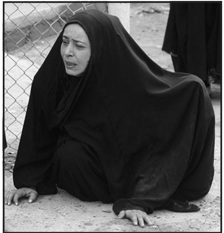
According to the United Nations, domestic violence and "honor" killings are on the rise in Iraq. Rapes quadrupled between 2003 and 2006.

"The political climate in Iraq is such that anyone can carry out crimes against women," without any protection from the