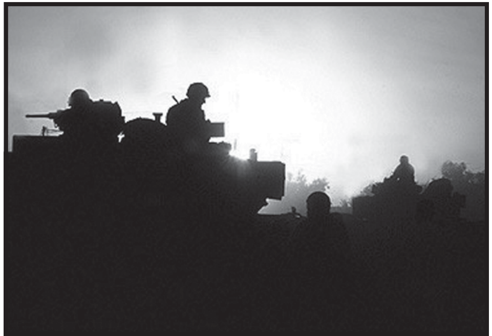
Behind the veneer of disagreement, Democratic leadership agrees with the Bush White House on the importance of enforcing multinational access to oil in Iraq and elsewhere.

It is notable that the hydrocarbon law comes in first place in this clause, ahead of "legislation necessary for the conduct of provincial and local elections," reform of de-Baathification laws, amendments to the constitution and allocation of rev-